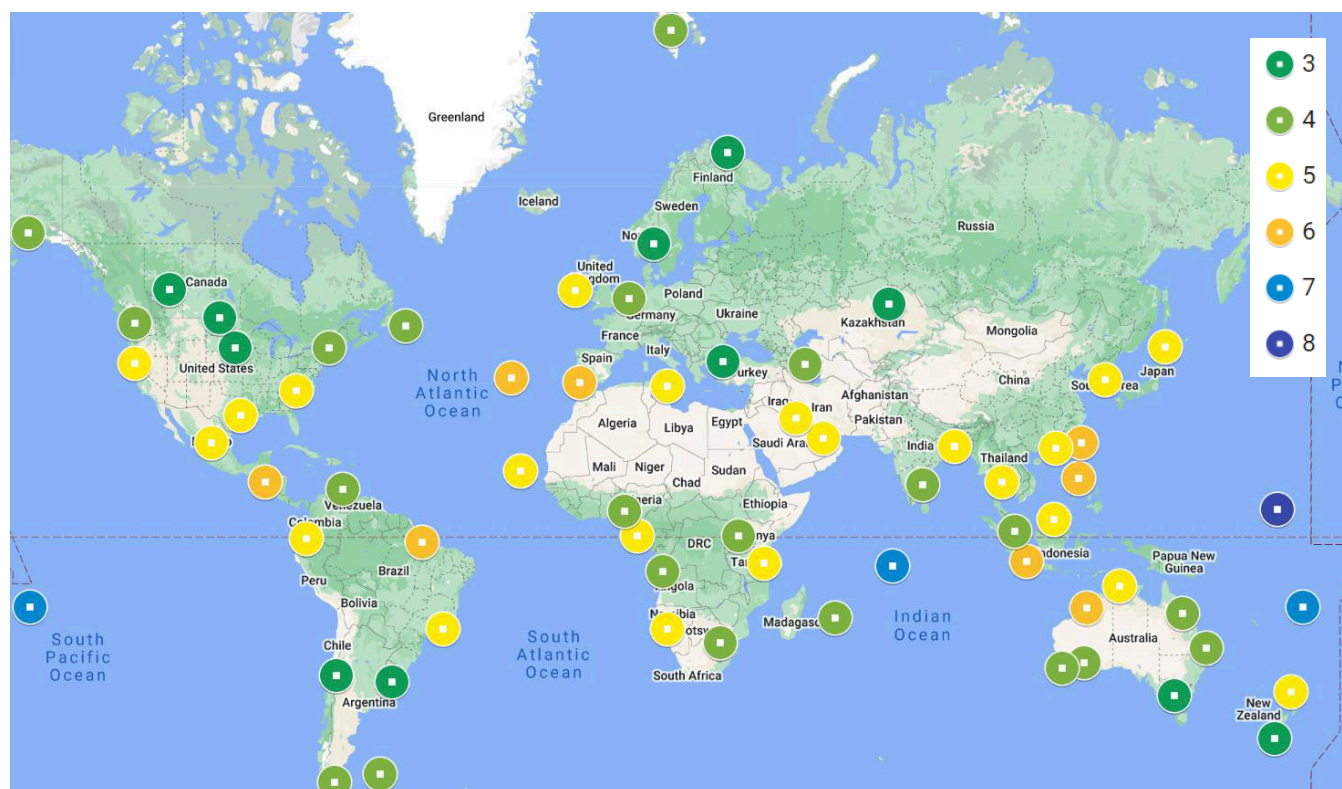
Figure 2: J-Star Height Accuracy in cm

J-Star is a subscription service, and included in selected JAVAD products for 1 year. Subscriptions apply after the first year. Contact sales@javad.com or your local dealer for J-Star capable receivers.